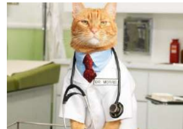
Health Check and Complete Records