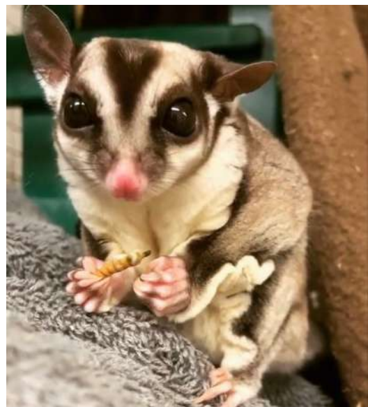
Treacle- Nocturnal room