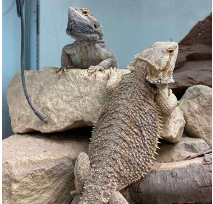
Beatrice and Boo- Exotics room