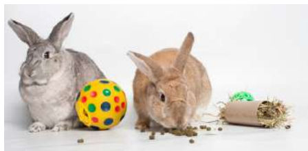
Provide a Stimulating Environment