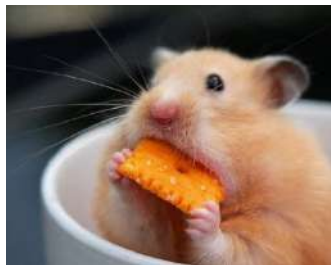
Provide Food & Water