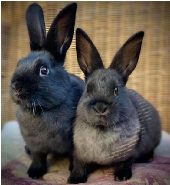
Dandelion and Weed- Mammal room

Outdoor paddock - Home to a herd of goats alongside ducks and geese