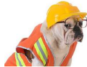
Check the Accommodation for Safety and Security