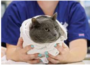
Handling & Restraining Safely

Animal husbandry is a blanket term used to cover all the necessary care required to meet an animal's needs. This includes: