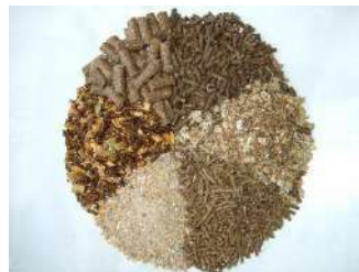
Monitor Food & Water Intake