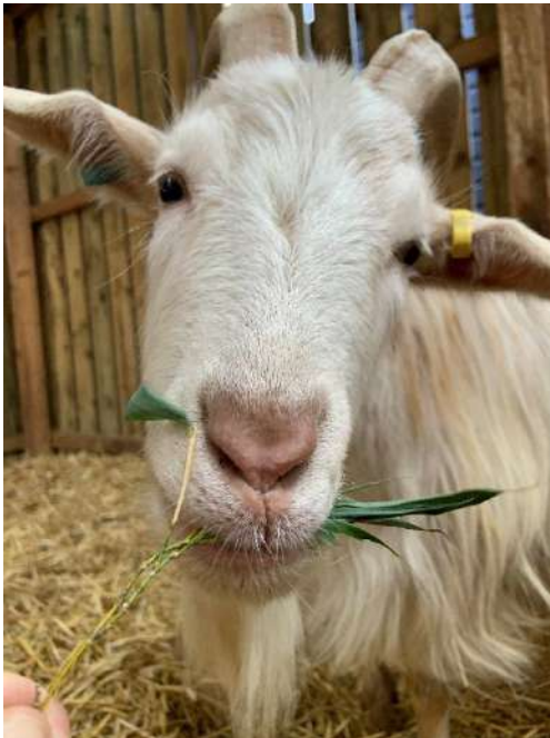
Hank- Outdoor paddock