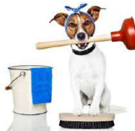
Maintain and Clean Accommodation